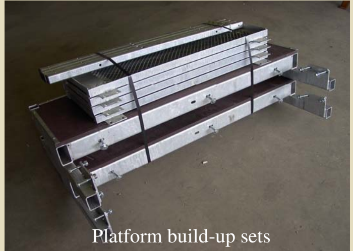
Platform build-up sets

By means of a partially open cabin, goods and persons can be transported with a lifting speed of 24 m/min.