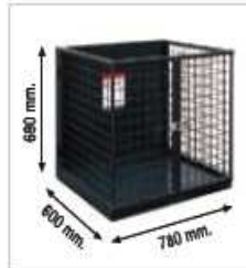
JAJULA ESTÁNDAR STANDARD CAGE (600 mm. x 780 mm. x 690 mm.)