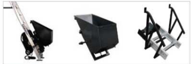
CONTENEDOR AUTOMÁTICO (70 L) AUTOMATIC CONTAINER (70 L)