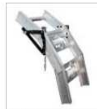
TRAMO ARTICULADO ARTICULATED SECTION