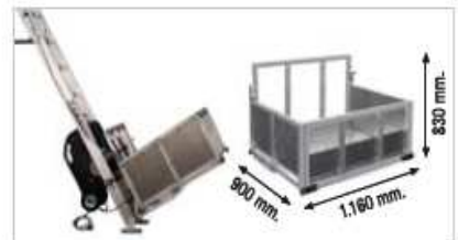
JAJULA ALUMINIO ALUMINUM CAGE (900 mm. x 1,160 mm. x 830 mm.)