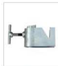
FIJACIÓN ANDAMIO SCAFFOLDING CLAMP