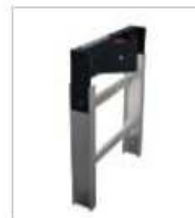
TRAMO FINAL FINAL SECTION