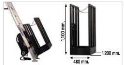
JAJULA ESPECIAL SPECIAL CAGE (480 mm. x 1,200 mm. x 1,100 mm.)