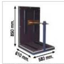
PLAT. TRANSP. PLACAS SOLARES SOLAR PANEL TRANSP. PLAT.